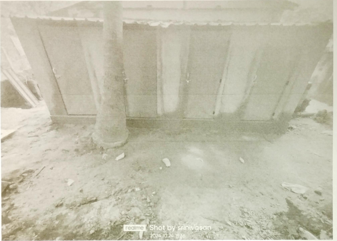
realme 2024.10.24.11.36