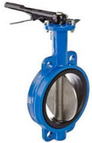
FIRE9710-Fire&safety-Butterfly valve PN16 -50mm-No's