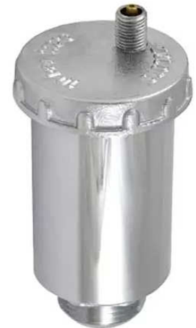
HVAC2886-HVAC-Air Release Valve-20mm-No's