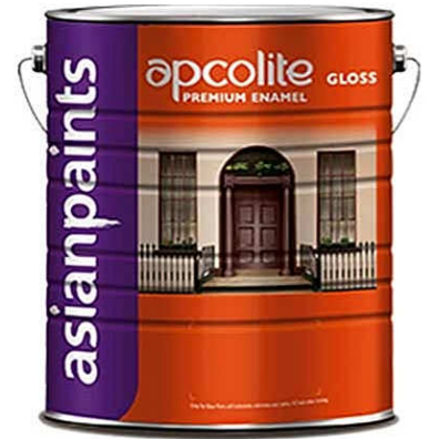
PAIN5030-Paints-Enamel-Post Office Red-4Ltrs- Can