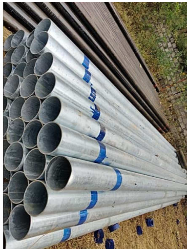
STEEL2516-Steel-MS Round pipe-B Class-100DX6000Lmm-Kg's