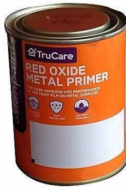
PAIN8548-Paints-Red Oxide Primer-Asian-1Ltr- Can