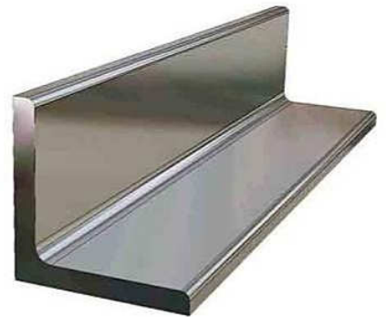
STEL7401-Steel-MS L Angle-40X40X6Tmm-Kg's