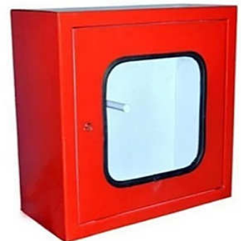
FIRE6664-Fire&safety-Hose Box-single door-No's