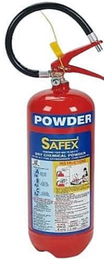
FIRE2803-Fire & Safety-Dry type Fire extinguisher-6 Kgs-No's