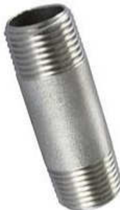
STEL4979-Steel-MS Threaded Nipple-150LX80Dmm-No's