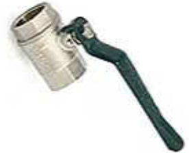
FIRE3382-Fire&safety-Forged brass ball valve-Valve 25mm-No's