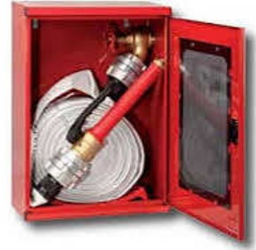
FIRE7717-Fire& Safety-Fire Hose Cabinet-900X1500X150mm