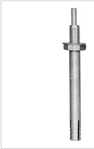
HARD4639-Hardware-Anchor bolt-Pin Type-12x62.50mm-No's