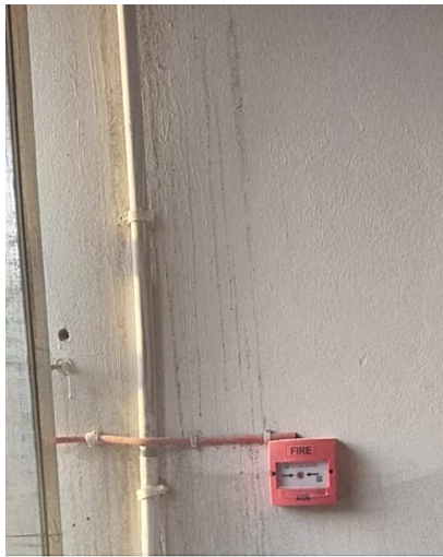
FIRE7360-Fire& Safety -Manual call point -Non addressable-Nos