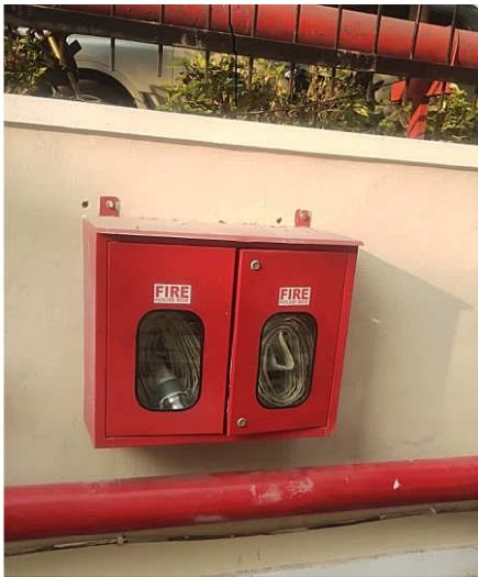
FIRE1291-Fire & Safety-Hose Box-Double Door-Nos