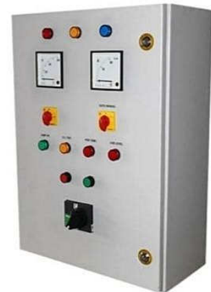
FIRE5063-Fire & Safety-Booster pump panel-12.5Hp-No's