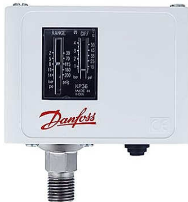
FIRE6238-Fire & Safety-Pressure switch-No's