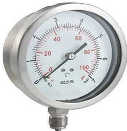
FIRE6575-Fire & Safety-Pressure Gauge-0 to 10.5Kgs-No's