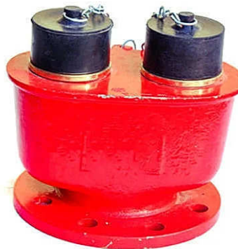
FIRE4281-Fire & Safety-Fire Brigade Inlet-2way-100mm-No's