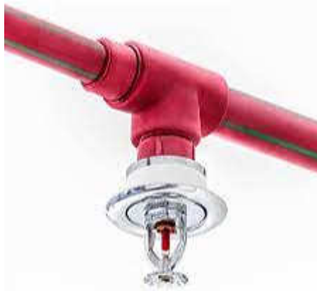
FIRE6625-Fire & Safety-Fire fighting-Fire sprinklers-No's