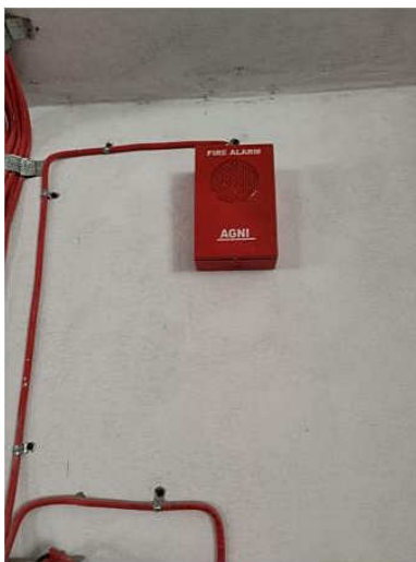
FIRE2644 -Fire & Safety- Hooters - Non Addressable-Nos.