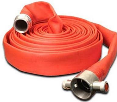
FIRE9515-Fire & Safety-RRL type A Hose pipe-63Dmm-No's