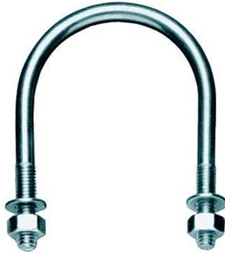
HARD2902-Hardware-GI U Clamp+Nut+Washer-100x8mm-No's