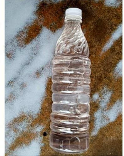
PAIN8788-Paints-Turpentine oil-1 ltr can