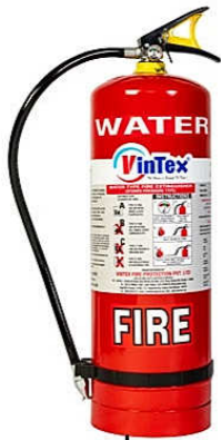
FIRE2009-Fire & Safety-Wet type Fire extinguisher-9 Ltrs