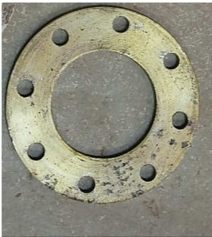
FIRE8108-Fire & Safety-MS Flange-E table-100mm-No's