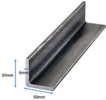
STEL6449-Steel-MS L Angle-50X50X6Tmm-Kg's