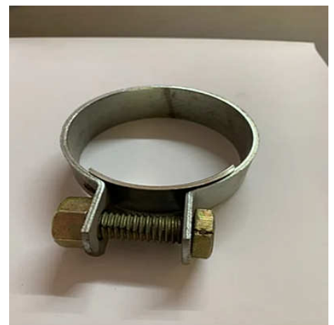
HARD4627-Hardware-GI Hose clamp-heavy duty-20Dmm-No's