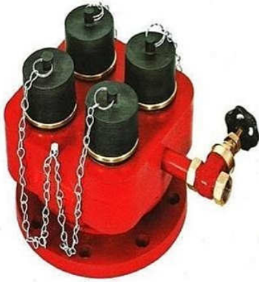
FIRE3271-Fire & Safety-Fire Brigade Inlet-4way-150mm-No's