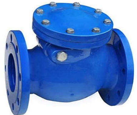
PLUM6888-Plumbing-Non return valve-100mm-Nos