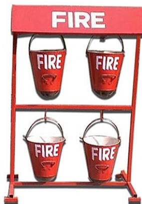
FIRE2909-Fire & Safety-4 Buckets+Stand-No's