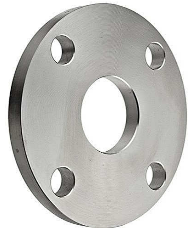
STEL3746-Steel-MS MS Flange-E table-80DX4 Holes-No's