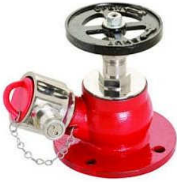
FIRE5317-Fire&safety-SS Hydrant valve -63Dmm-No's