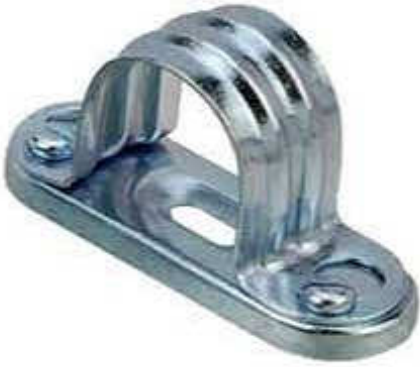
ELEC8660-Electrical -GI Base saddle 25mm-Boxes