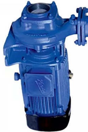
FIRE1752-Fire & Safety-Pressure Booster pump-Kritloskar KDS 1348-12.5hp-No's