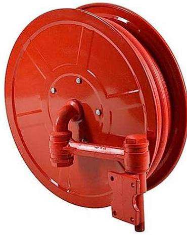
FIRE5726-Fire & Safety-Hose Reel Drum-30mtrs-Nos