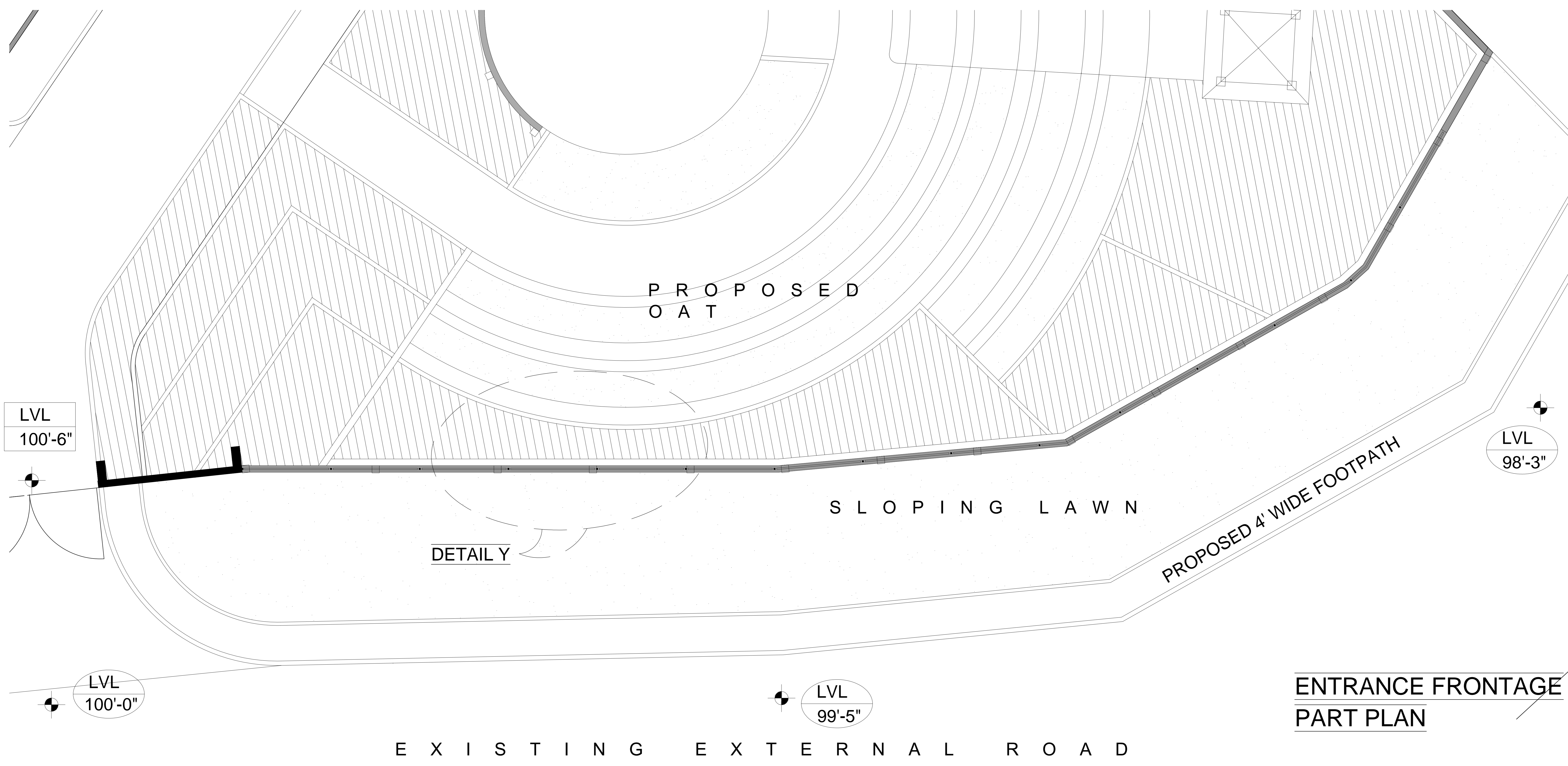
ENTRANCE FRONTAGE PART PLAN

M/S. NARSIMHAM ASSOCIATES, HAS THE COPY RIGHTS OF THIS DOCUMENT, AND IT SHOULDN'T BE USED BY ANYBODY WITHOUT THE WRITTEN PERMISSION OF THE ARCHITECT.