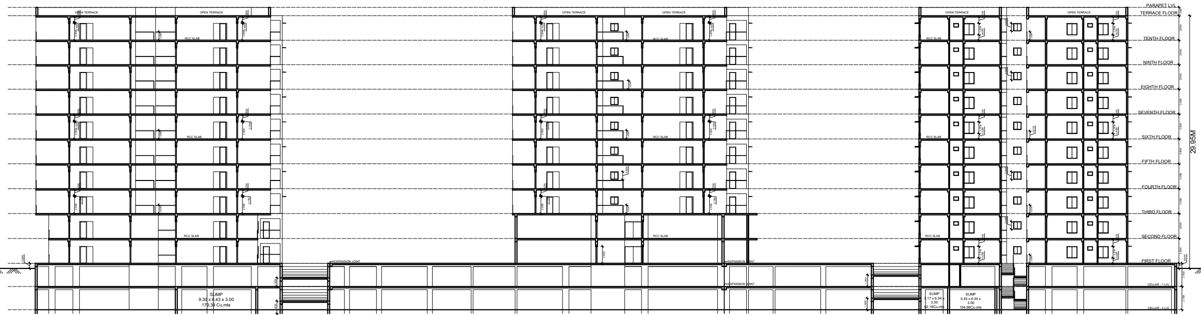
SECTION AT AA