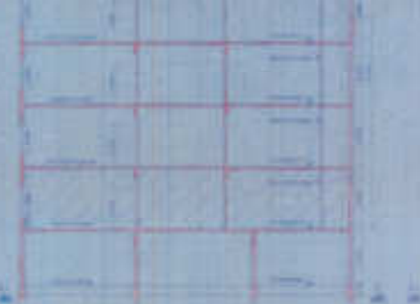
SECTION AT A-A