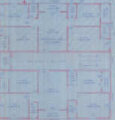
FIRST FLOOR WORKING PLAN