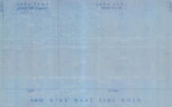
EMBEDDING OF PLAN