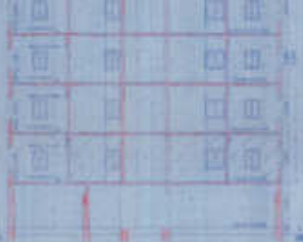
SECTION AT B-B