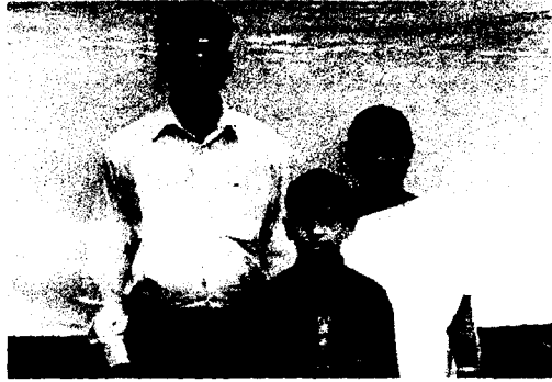
Family Members Details