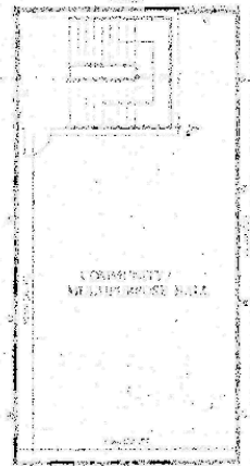
FIRST FLOOR PLAN COMMUNITY / MULTIPURPOSE HALL