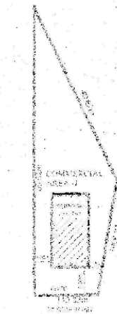
SITE PLAN SCALE 1:1000

COMMERCIAL COMPLEX PLOT AREA 600.55 Sq. mts (13.71 Hectare) SITE COVER AREA 1.16 Hectare (13.71 Hectare)