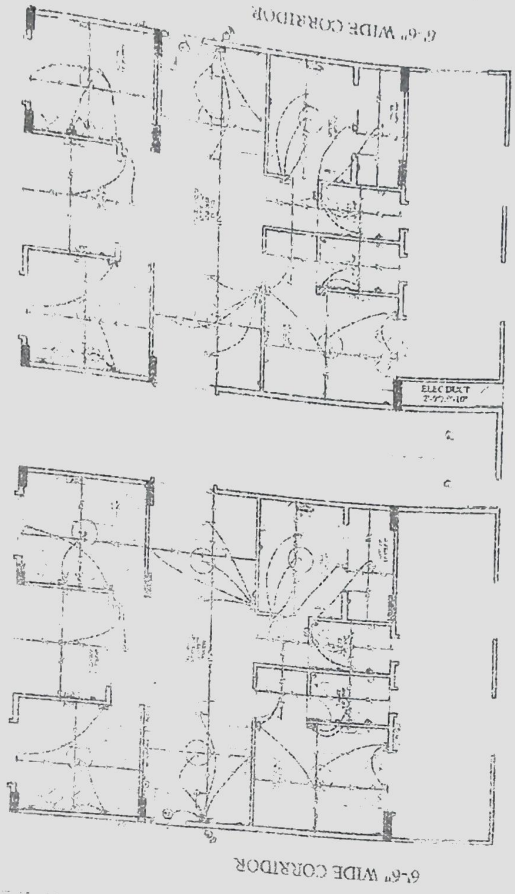
6'-6" WIDE CORRIDOR